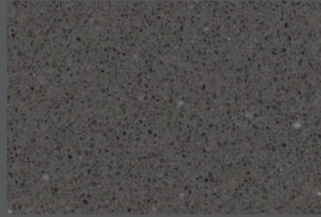
qf dark grey