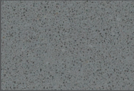
qf light grey